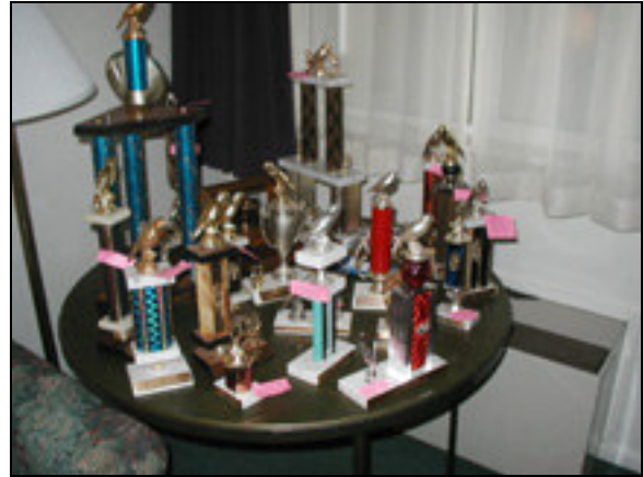
All the Trophies