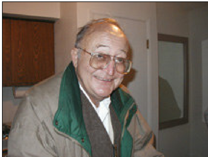
Judge Fred Proebstel