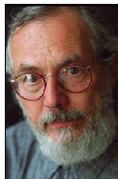
Reporter Tan Vinh & Photographer Alan Berner of The Seattle Times